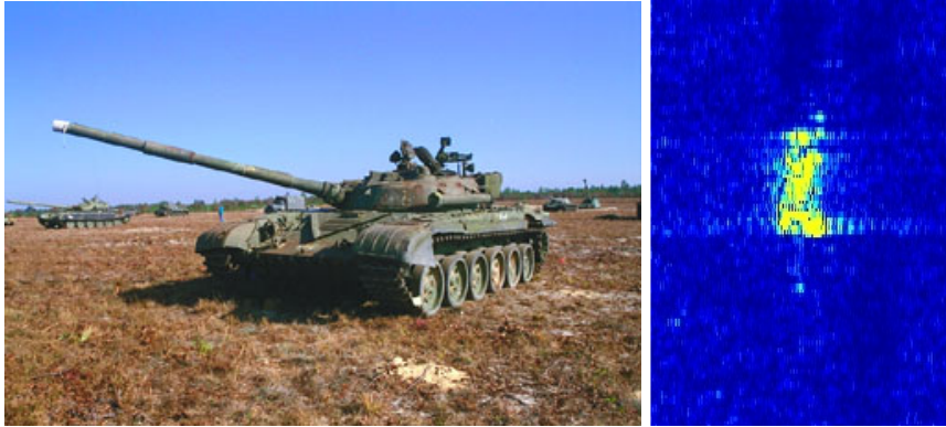
Figure 1: T-72 tank and SAR-fft-based reconstruction