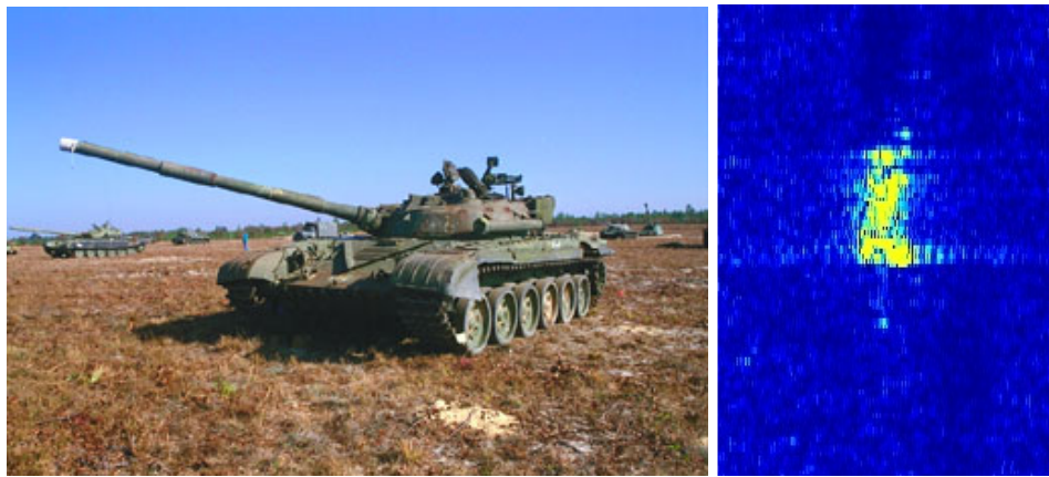
Figure 1: T-72 tank and SAR-fft-based reconstruction

Figure 1 shows a T-72 tank and a typical SAR image of the vehicle. Each line originates as estimated power spectrum of the radar echo in the relevant “distance bin”. Due to the large number of scatterers in the ground modern nonlinear methods have had limited applicability since they tend to generate high order models, and thus, numerically unreliable. As a consequence fft-based techniques have so-far remained the standard. In contrast, our techniques, via use of specialized statistics, allow a degree of “focusing” and lead to low order and more reliable models.